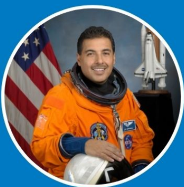
JOSÉ HERNÁNDEZ Keynote Speaker

José Hernández: Former NASA astronaut, aerospace consultant, motivational speaker, and founder of Reaching for the Stars Foundation.