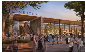
Rendering of the new HSR station in Merced

Early HSR operations are expected to begin on the 171-mile Merced to Bakersfield segment between 2030 and 2033, while the later Phase 1 will extend HSR north to Sacramento, through Stanislaus County. As the backbone of the integrated passenger rail/transit vision for the San Joaquin Valley, HSR will substantially improve travel times and service frequency throughout Stanislaus County and the region.