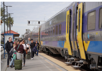
Service on the San Joaquins will expand as part of the Valley Rail program.

Valley Rail includes improvements and expansions of both the San Joaquins intercity (Amtrak) and ACE commuter rail, which will result in increased services between the San Joaquin Valley,